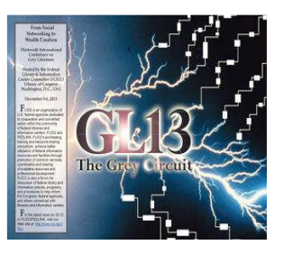
The Grey Circuit, From Social Networking to Wealth Creation http://www.textrelease.com/gl13callforpapers.html

On April 10<sup>th</sup> 2011, the Call for Papers closes and on April 28<sup>th</sup>, the Program Committee will meet at the New York Academy of Medicine to evaluate the abstracts submitted and finalize this year's Conference Program. Participants who seek to present a paper at GL13 are now invited to submit an English abstract between 300-400 words. The abstract should deal with the problem/goal, the research method/procedure, an indication of costs related to the project, as well as anticipated results of their research. The abstract should likewise include the title of the proposed paper, topics most suited to the paper, the name(s) of the author(s), and full address information. Abstracts are the only tangible source that allows the Program Committee to guarantee content and balance in the conference program. Every effort should be made to reflect the content of your work in the abstract submitted.