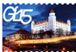
Bratislava Slovakia, 2013