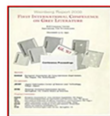
Amsterdam Netherlands, 1993