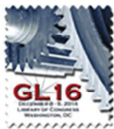
Washington DC United States, 2014