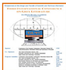
Luxembourg Luxembourg, 1997