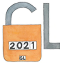
Amsterdam Netherlands, 2021