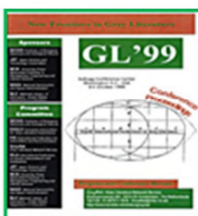
Washington DC United States, 1999