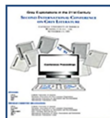
Washington DC United States, 1995