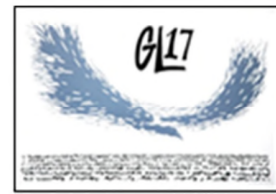
Amsterdam Netherlands, 2015