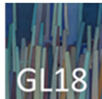
New York United States, 2016