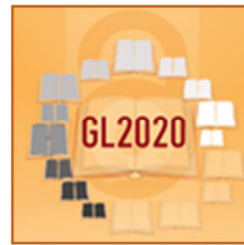
Rome (Online) Italy, 2020