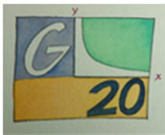
New Orleans, LA United States, 2018