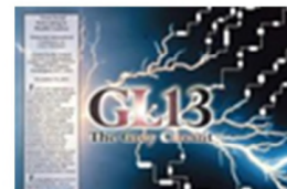
Washington DC United States, 2011