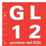
Prague Czech Republic, 2010