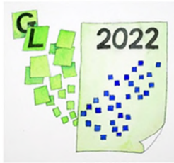
Bethesda MD United States, 2022