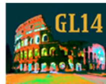
Rome Italy, 2012