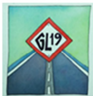
Rome Italy, 2017