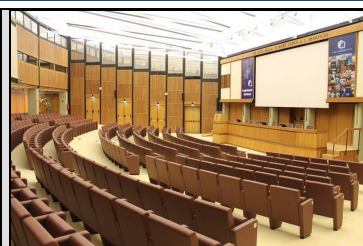
Main Conference Hall