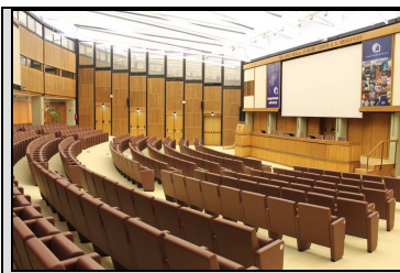
Main Conference Hall