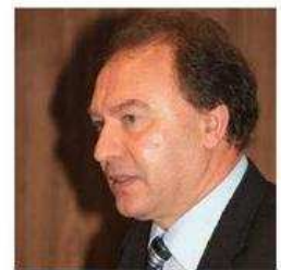
Moderator Day Two