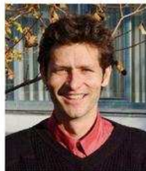
Moderator Day One