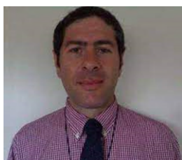
Giovanni De Simone Italian National Research Council; Central Library Italy